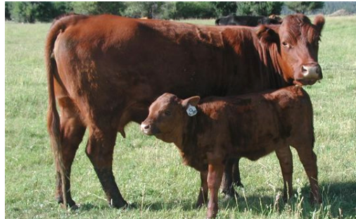
American Herbataurus Cow/calf

Do you have the right equipment to harvest your grass? Your cows should produce a calf every year, nurse it for ten months, and maintain body condition all year on grass, hay and minerals. Do you know what that cow looks like and where to find them? The American Herbataurus Society is here to help. Our vision is to help both the commercial and direct marketing beef producer establish genetic quality and stability, and grass-based functionality in his/her herd.